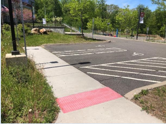
To the left of the bench location