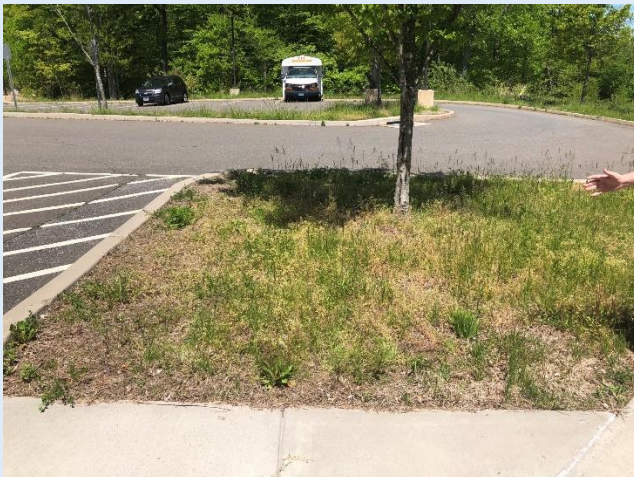
Bench will be located here which is adjacent to handicap parking.

i Facilities committee and facilities department will need to approve location. Funding for the bench, engraving, delivery and installation will be funded handling by TFA Location agreed to with custodial staff is in grass area next to handicap parking;